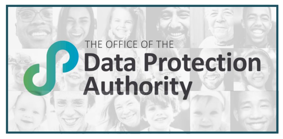
Your latest monthly update from The Office of the Data Protection Authority.